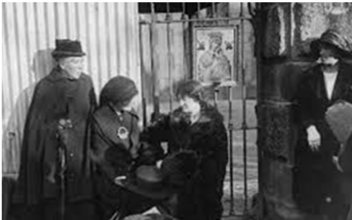
MAUD GONNE AND ANNIE MACSWINEY OUTSIDE MOUNTJOY 1922