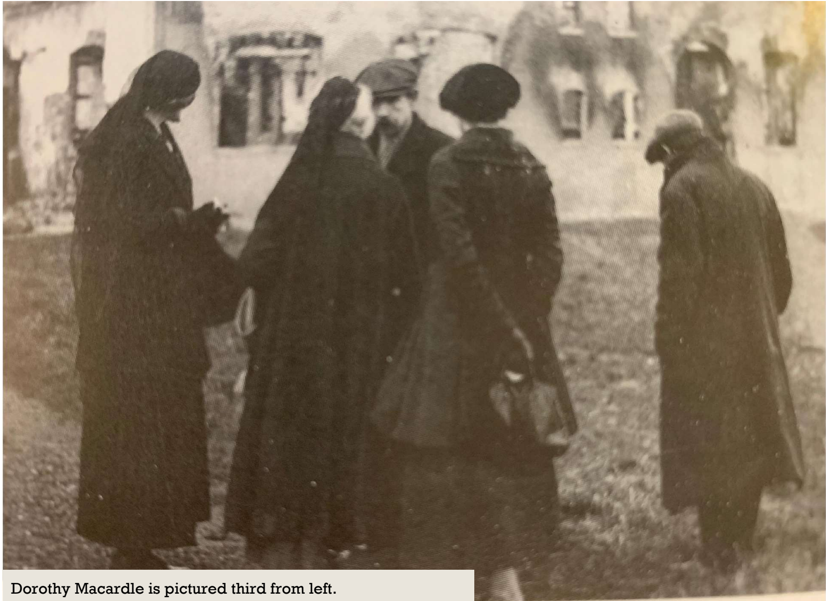
Dorothy Macardle is pictured third from left.