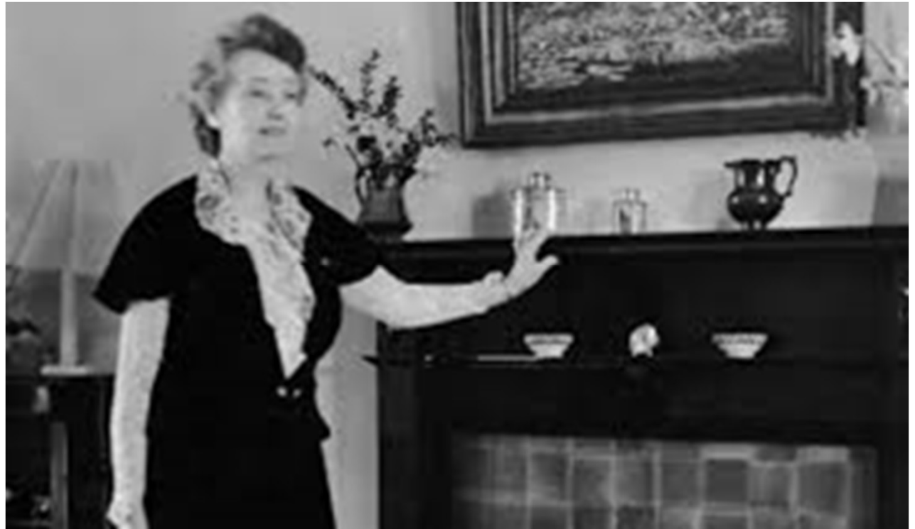
DOROTHY IN LATER YEARS