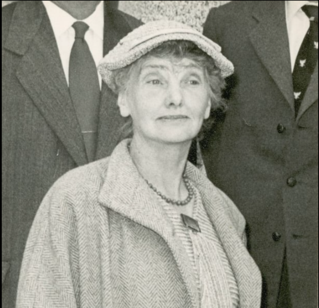
Press photo of Dorothy Macardle

Dorothy Macardle was a playwright, historian, Gothic novelist, and international human rights rapporteur. She published several critically acclaimed gothic novels, one of which, The Uninvited , was adapted into a major Hollywood horror film in the 1940s. She was the author of a significant history called The Irish Republic , published in 1937. After the Second World War, Dorothy wrote a human rights report into the plight of minors orphaned and separated as a result of Nazi atrocities in Europe. Daughter of Sir Thomas Macardle, founder of the Macardle Moore brewing enterprise in Dundalk, she rejected her family's imperial values and became - in her own words - "an unrepentant propagandist" on behalf of the Irish Republican cause. During the Civil War, she was imprisoned without trial in November 1922, accused of anti-Treaty propaganda. She spent six months in prison, first at Mountjoy, later at Kilmainham and finally, briefly, at the North Dublin Union.